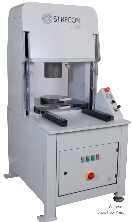
Compact Shop Floor Press